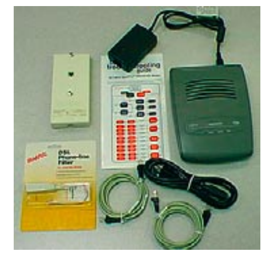
Image 1: DSL in a Box included cables, the modem, instructions for set-up, and telephone filters. Not shown: the packaging, which also contained helpful instructions for set-up.

It's well known that there are many barriers to adoption for new technologies: culture, economics, tradition, existing systems, and competitors, to name a few. The means of overcoming these barriers have traditionally focused on marketing (to craft campaigns to promote and sell more products), economics (for example, removing